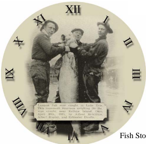
Fish Story - 1935