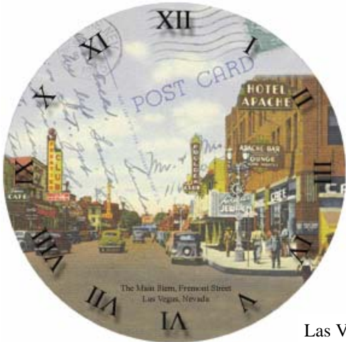
Las Vegas, NV 1948