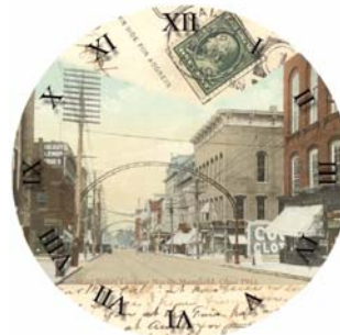
Mansfield - 1909