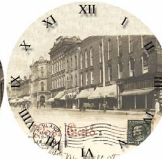
Ashland - 1910