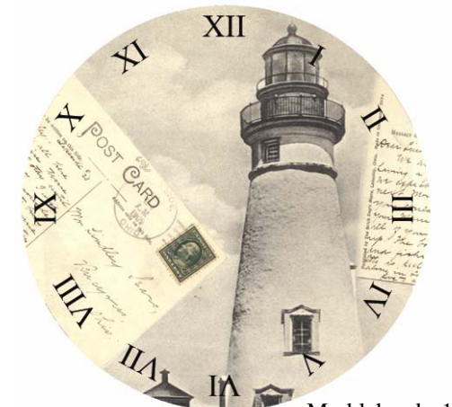
Marblehead - 1909