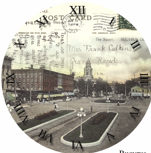
Bucyrus - 1913