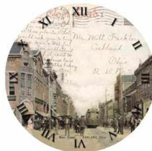
Ashland - 1911