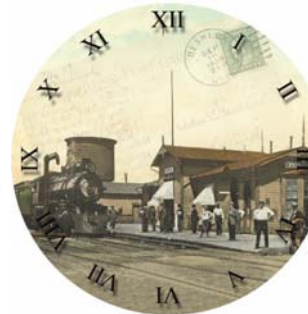
B & O Depot - Mansfield