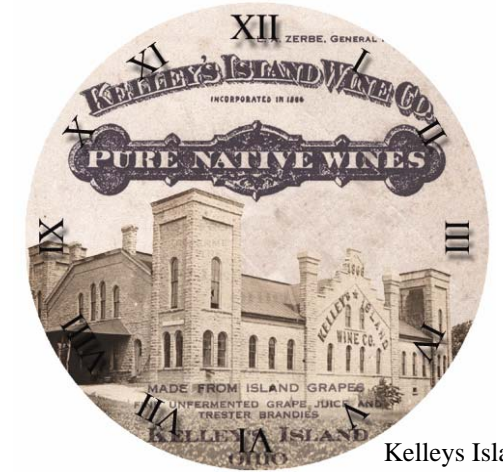
Kelleys Island Winery - 1932