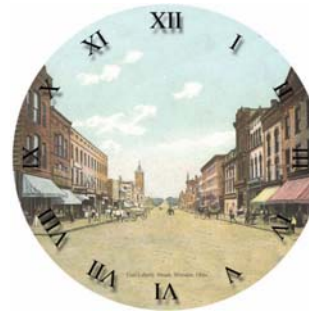
Wooster - East Liberty St.