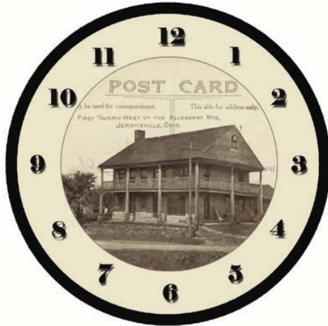
Old Time Tavern Jeromesville, Ohio