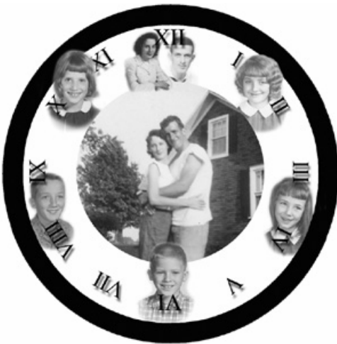
Custom Clock Example