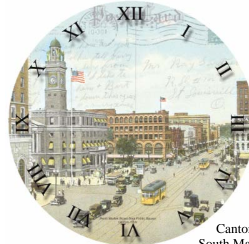
Canton, Ohio South Market Street