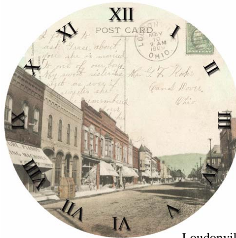
Loudonville - 1909